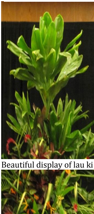
Beautiful display of lau ki