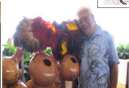
Do what you love and love what you do...Hand-made implements.