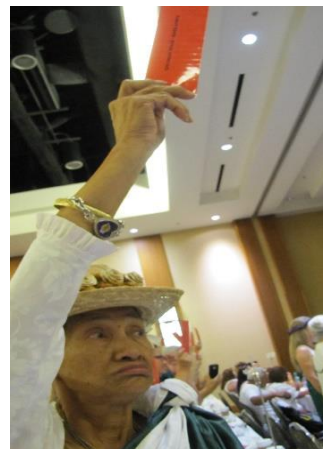
The 55 th Annual AOHCC Convention: election year. Delegates voted for new AOHCC incoming Officers.