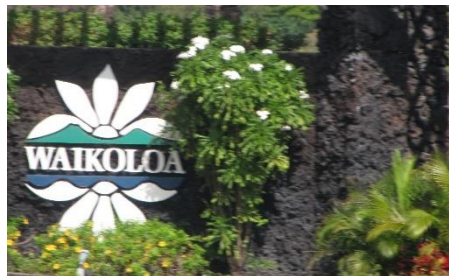
Events held at the Waikoloa Beach Resort Marriott on Moku o Keawe .