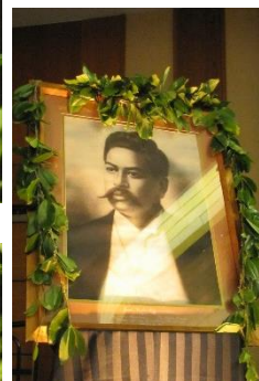
Prince Jonah Kuhio